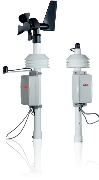
ABB monitoring and communications VSN800 Weather Station

The VSN800 Weather Station automatically monitors site meteorological conditions and photovoltaic panel temperature in real-time, transmitting sensor measurements to the Aurora Vision® Plant Management Platform.